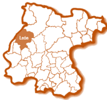
Figure 11: Leon localization in Guanajuato State.

The weather is temperate; it is hot in the spring (March to June) and rains during the summer (July to September) and autumn (October to December); in the winter the temperatures drop.