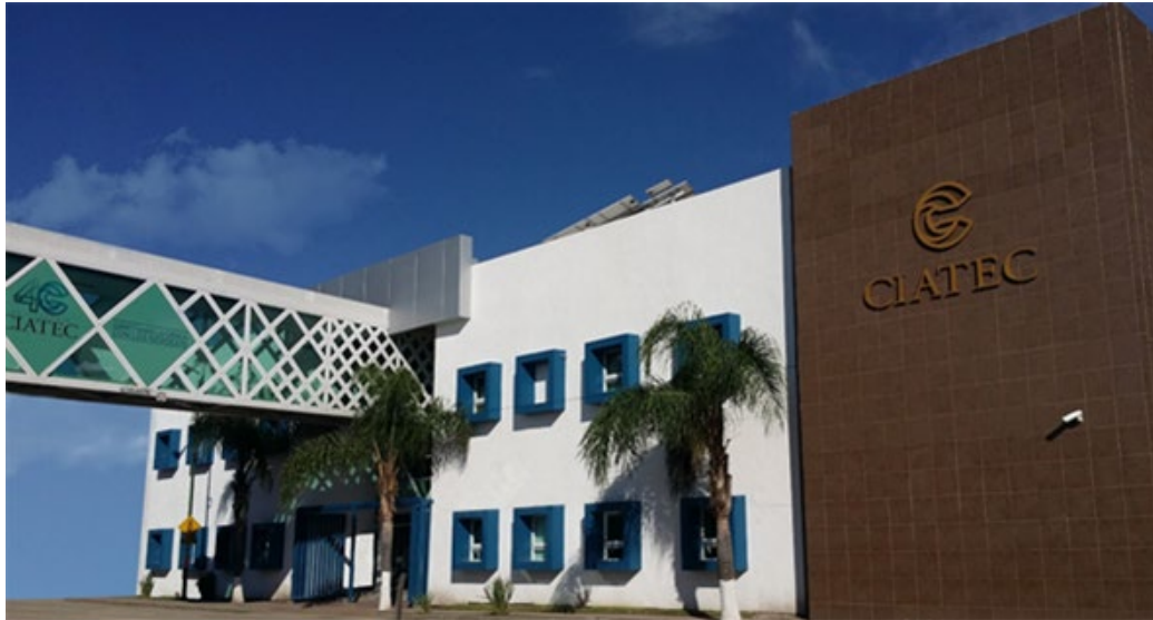
Figure 8: CIATEC institution