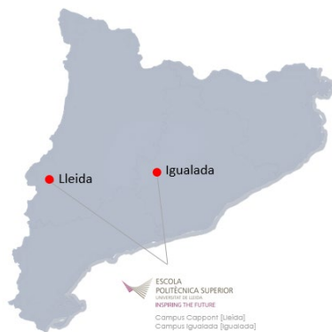
Figure 4: Location of Igualada and Lleida in the Catalan Territory.

The weather is temperate from March to October, being the summers months (June, July, August) very hot and cold temperatures in winter (from November to February).