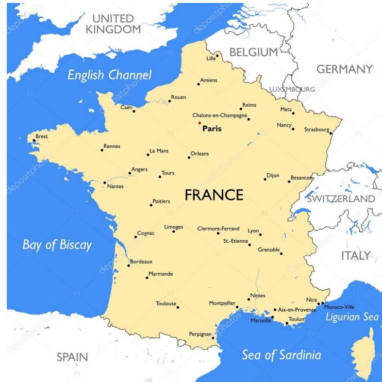
Figure 13: France map.