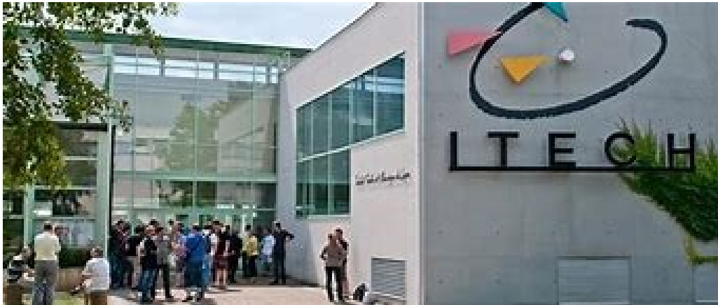
Figure 12: ITECH institution