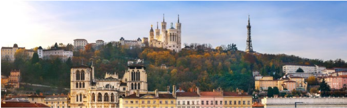
Figure 14: Lyon city.

Lyon is a very dynamic student city and offers many services to facilitate access to culture and leisure activities. Lyon is also the capital of gastronomy!