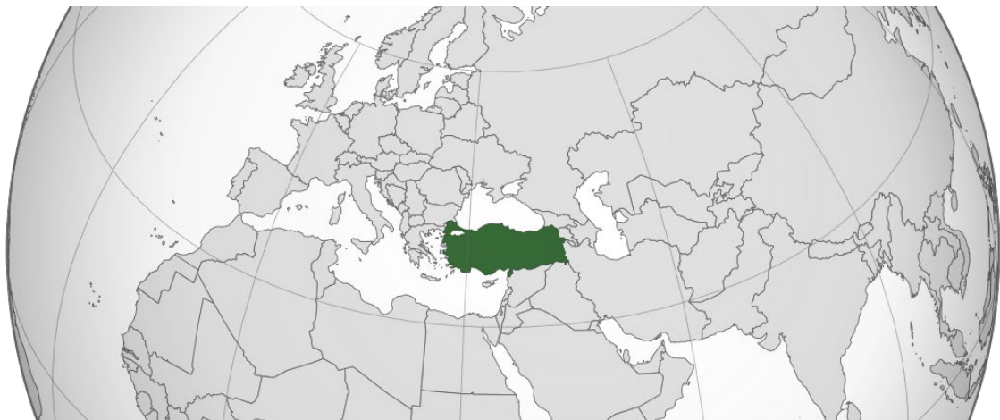
Figure 6: Turkey

The population of Turkey is over 86 million. The official language of the country is Turkish. Istanbul, the largest city in Turkey, is built on land in the Bosphorus and the city is partly in Europe and partly in Asia. Ankara is the capital and the second largest city of Turkey located in Central Anatolia. Turkey is a candidate for full membership to European Union. The currency is the Turkish Lira. 1 TL = 0.05 USD (approximately).