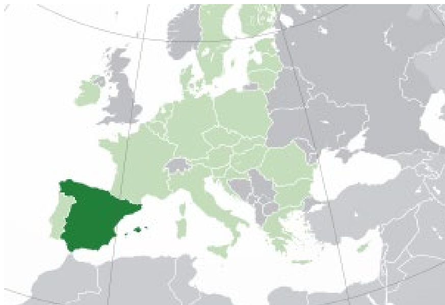
Figure 2: Location of Spain in Europe.

Spain is a country primarily located in southwestern Europe with parts of territory in the Atlantic Ocean and across the Mediterranean Sea. The largest part of Spain is situated on the Iberian Peninsula; its territory also includes the Canary Islands in the Atlantic Ocean, the Balearic Islands in the Mediterranean Sea, and the autonomous cities of Ceuta and Melilla in Africa. With an area of 505,990 km 2 (195,360 sq mi), Spain is the second-largest country in the European Union (EU) and, with a population exceeding 47.4 million, the fourth-most populous EU member state. Spain's capital and largest city is Madrid; other major urban areas include Barcelona, Valencia, Seville, Zaragoza, Málaga, Murcia, Palma de Mallorca, Las Palmas de Gran Canaria and Bilbao. The currency is the Euro. 1 € = 1 USD (approximately).