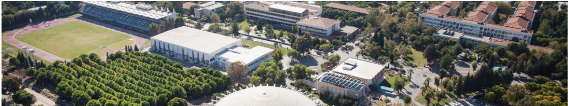
Figure 5: Campus of EGE University.

Ege University, established on May 20 th , 1955, as Turkey's fourth, the region's first and the oldest university, acts as a focal point for education, research, cultural and social activities in the city of Izmir and the Aegean region. EGE University carries the fundamental ideal of achieving excellence and highest quality in undergraduate and graduate education, in research and in public service by encouraging critical intellectual development, combining research and teaching, redefining educational goals of this millennium and by utilizing physical and human resources to provide a better learning environment and guided learning.