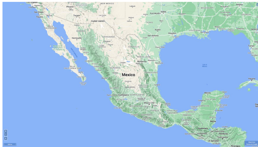
Figure 9: Mexico map.