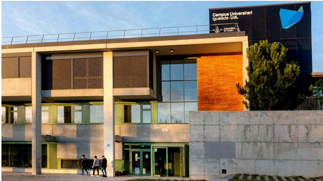
Figure 1: Campus of Igualada, University of Lleida – UdL. https://youtu.be/aSnvKpqaDLC

The aim of the University of Lleida is the education of its students. We provide high standards of teaching with quality services throughout the university community that reach society beyond the campus gates. Students make up most of the UdL community, and our objective is to ensure that they enjoy the teaching and learning processes involved. They will thus be able to develop both at a professional and personal level by following other educational, cultural or leisure activities, and by participating in the UdL to keep it a lively, ever-improving educational institution. We offer a wide range of services in order to help students in their academic life and extra-curricular activities.