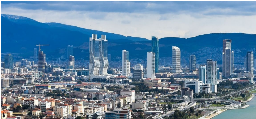
Figure 7: The City of Izmir.

The city of Izmir is one of the oldest settlements of the Mediterranean basin. Izmir, the roots of which go back till Neolithic period, is a unique city with a rich historical beauty. The city acquired her name from an Amazon queen called Smyrna and was mentioned by famous historian Herodotus as "the city under the most sublime blue sky and on the remarkable climate". Izmir has been the centre of many religions due to the sacred places belonging to Judaism, Christianity and Islam. The existence of holy places in the vicinity of Izmir such as Mary's House proclaimed as a significant place of Pilgrimage, the Double Church dedicated to the Virgin for the first time, the Basilica of St. John, including the tomb of Christ's beloved friend, the Grotto of Seven Sleepers and the Seven Churches of Revelation built to serve the spread of Christianity makes is one of the focal points of Faith Tourism.