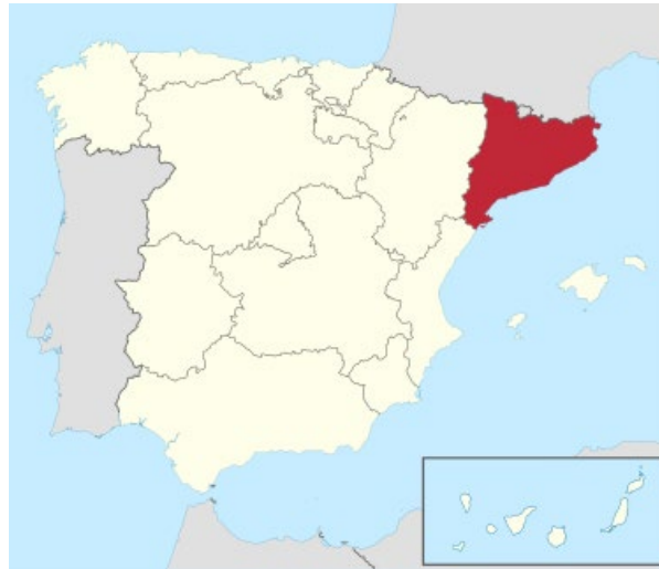
Figure 3: Location of Catalonia in Spain.

Catalonia is in the northeast side of Spain. It is administratively divided into four provinces: Barcelona, Girona, Lleida, and Tarragona. The capital and largest city, Barcelona is the second-most populated municipality in Spain and the fifth-most populous urban area in the European Union. The official languages are Catalan and Spanish. The Catalan economy is based on strong industrial activity. Manufacturing and industry-related services account for 50% of Catalonia's GDP. The industry sectors in Catalonia are powerful and diverse, capable of generating growth due to its capacity to form synergies between many activities.